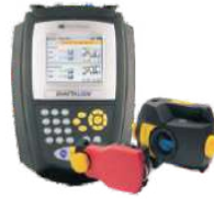
SHAFTALIGN OS3 Laser shaft alignment system for beginners with single-laser technology