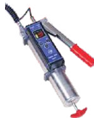
A4910 LUBRI Monitoring and Control of Lubrication Process + Vibration Data Collector