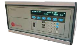
236 Technical Data Sheet

Model 246 For Use with Soft-Bearing Balancing Machines Portable Design for Use in On-Site Balancing Digital Readout