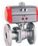
Ball Valve Pneumatic

Standard : JIS 10K, PN 16, PN 40, ANSI 150, ANSI 300 Type : Single Acting & Double Acting Body : Cast Iron, Cast Steel, WCB A216, SS304, SS316 Connection : Screw BSPT, Flange End