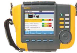
Fluke 810 On-site vibration analysis: at a glance