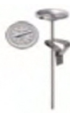
Photo Developing Thermometer