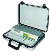
246 Technical Data Sheet

Model 295 Series For Use with Soft-Bearing Balancing Machines Enhanced Operator Tools & Reports Easy to Use Interface