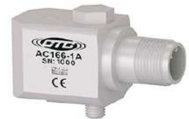
Ac166 3 Wire Negative Voltage Accelerometer, side exit