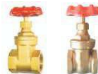
Gate Valve #125 / #150

Body : Brass, Bronze Disc : Brass, Bronze Type : Non Rising stem Connection : Screw BSPT