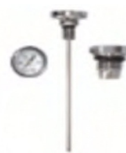
Motorcycle and ATV Accesosies