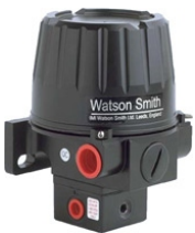
Watson Smith Electronic I/P converter Type 140 EX14001BK4LE2

WATSON SMITH P/I CONVERTERS TYPE 68 681510; BRAND NEW, ORIGINAL IN UK;