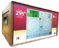
295 Series Technical Data Sheet

Model 295 Series For Use with Soft-Bearing Balancing Machines Enhanced Operator Tools & Reports Easy to Use Interface