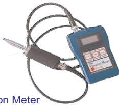
206 Vibration Meter

Single channel vibration meter with accelerometer Portable, simple to use meter for measuring overall vibration on rotating machinery Follows the 10 - 1,000 Hz overall RMS velocity range recommended by ISO 10816