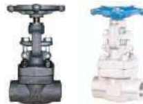
Gate Valve Bolted Bonnet

Standard : #800, #1500, #2500 Body : A105, F11, F22, SS304, SS316 Type : OS & Y Connection : NPT, SW, BW