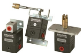
Watson Smith R27 Mechanically Operated Manostat 190400R

Watson Smith Electronic I/P converter Type 140 EX14001BK4LE2; Current to pressure converter type 140; The type 140 is a robust, explosion-proof pressure converter (I/P converter) with Triple Certification and IP66 & NEMA 4X weatherproofing and ExN Certification.