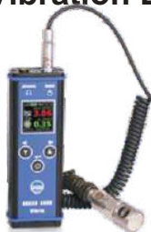
A4900 VIBRIO Vibration Meter, Analyzer and Data Collector in One