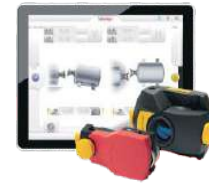
tab@lign Easy shaft alignment check on your tablet or smartphone