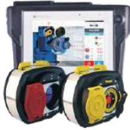
ROTALIGN touch The most powerful laser shaft alignment tool

Laser shaft alignment is the most efficient way of aligning machine shafts. Put simply, it saves time and money: increased machine availability, prolonged service life and maintenance intervals, lower power consumption!