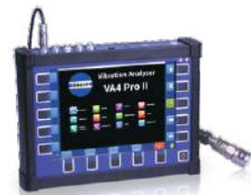
A4400 Va4 PRO II Va4 Pro II is a professional 4/4 channel signal analyzer built especially for vibration analyst who has the highest expectations of their equipment.