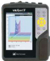
VIBXPERT II The expert in data collection, vibration analysis and field balancing

Prevent machinery failure and costly production downtimes! Our vibration measurement tools are used to check the condition of rotating equipment and detect early component wear and damage. Vibration analysis and balancing are integral parts of any condition-based and predictive maintenance programs.