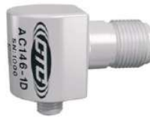
Ac146 Small Side Exit Sensor with built-in integral stud, 100mV/g, +/- 10% sensitivity.