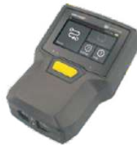
VIBSCANNER 2 The high-speed vibration data collector